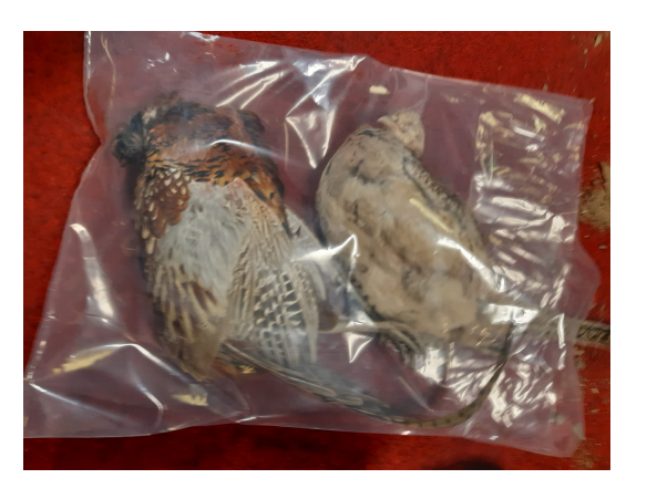
I am proud of the investment I have made as Commissioner to focus on rural crime

Wildlife crime is not only hugely damaging to our environment, but it can also impact local communities.