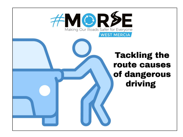
Too many people are killed or seriously injured on West Mercia's roads

We discussed how taking part in arts activities can inspire people to turn their lives around, and how Severn Arts are providing services to help