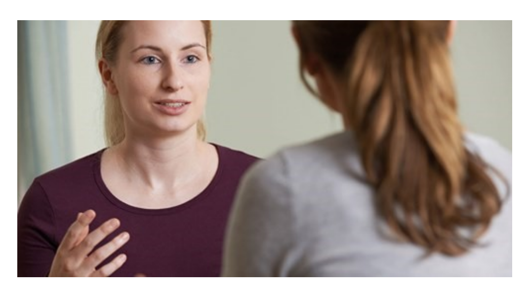
VACANCY - Policy and Commissioning Intern

Want a role where you can make a real difference to over a million people? A role where you can help build safer communities? A role where you can influence important decisions at a local and national level?