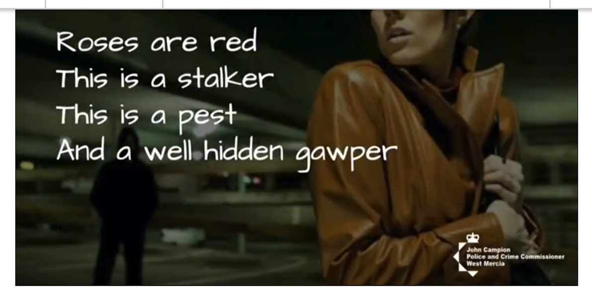
As commissioner, protecting victims sits at the heart of my commitments

Stalking, checking your partners' phone, coercive control and romance fraud should never be tolerated, Valentine's Day or otherwise.