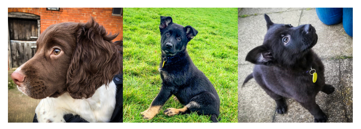
Three new recruits I am delighted to provide resources for...

Juno, Jabba and Simba are the latest recruits into West Mercia Police.