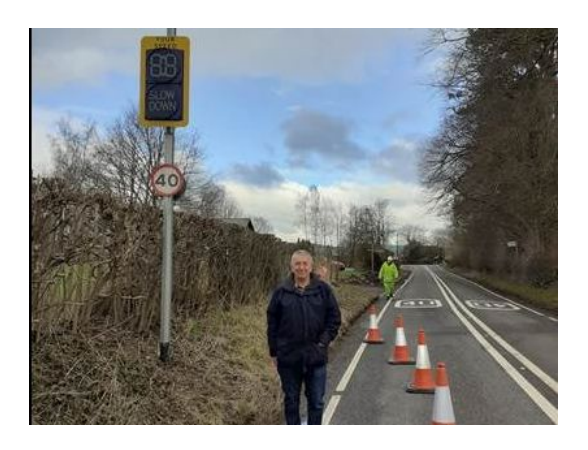
Continuing to deliver on my Safer Roads commitment

I have invested in a new Vehicle Activated Sign for the village of Culmington in Shropshire, which will help tackle speeding in the village.